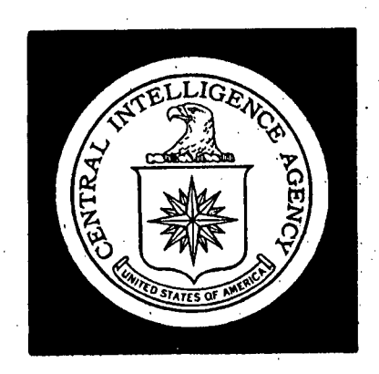
DIRECTORATE OF INTELLIGENCE

EO 12958 3.3(b)(1)>2 EO 12958 3.3(b)(6)>2 EO 12958 6.2(c)