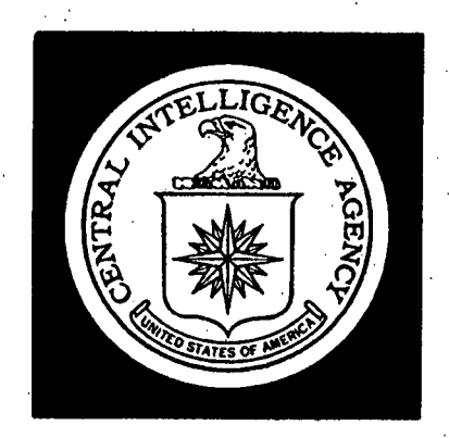
DIRECTORATE OF INTELLIGENCE