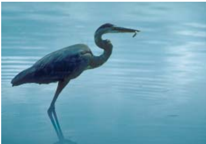
A Great Blue Heron in South Georgia.

Environment. Each of our business programs addresses environmental issues, but two are focused specifically on our mission to protect, restore, and manage the environment. The Environmental business program emphasizes environmental stewardship, ecosystem restoration, mitigation, environmental compliance, and research and development. During FY 2001, we continued to improve on our management of 713,374 acres of mitigation lands by achieving 78 percent of prescribed mitigation requirements. We participated in recovery programs for 78 federally listed species, engaging in 491 separate opportunities to benefit these species or their habitats. We also corrected 67 percent of significant environmental findings and 62 percent of major findings in FY 2001 at Corps-operated facilities. Complete correction of those findings, which were left open at the end of FY 2001, will be accomplished in FY 2002 subject to availability of funds. The correction of these findings eliminates the immediate threat the findings pose to the environment.