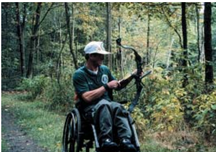
Accessible archery at the Corps' Conemaugh River Lake, Saltsburg, Pennsylvania.

Recreation. Most federal lakes were originally built for purposes other than recreation. Public needs and values have changed, however, and we have sought to serve the evolving public interest by adapting our reservoirs for multiple uses, including recreation where there is sufficient legislative authority and economic justification to do so. We operate more than 4,000 recreation sites at 456 water resources projects in 43 states. During FY 2001, the number of visitor-days at our outdoor recreation areas decreased slightly from 212 to 209 million, while our cost per visitor-day increased slightly from $1.24 to $1.28. In addition, the recreation program supports 500,000 full-time or part-time jobs and generates annual visitor recreation-related spending of $15 billion.