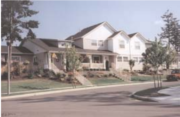
Improved housing shows our commitment to all soldiers and their families.

Management Initiatives. We recognize that our current programs will over time become more expensive to maintain. It is therefore essential that we transform our business practices so that we can continue to take care of our people, sustain readiness, and complete our transformation into a force for the 21st century.