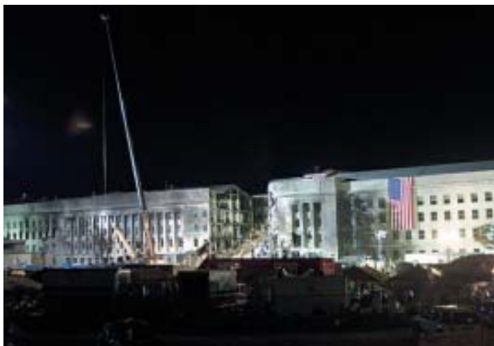
The portion of the Pentagon hit by a hijacked airplane on September 11, 2001, was illuminated as round-the-clock recovery efforts continued.

The Army is divided into three separate funding entities: the General Fund, Working Capital Fund, and Civil Works Fund. This annual report describes how these three funding entities support our people, Army readiness, and the transformation of our forces. Following the tragedy of September 11, 2001, the General Fund and Working Capital Fund received a waiver from the requirement to prepare and submit FY 2001 Financial Statements. The complete Financial Statements of the Civil Works Fund have been prepared and are included in this report.