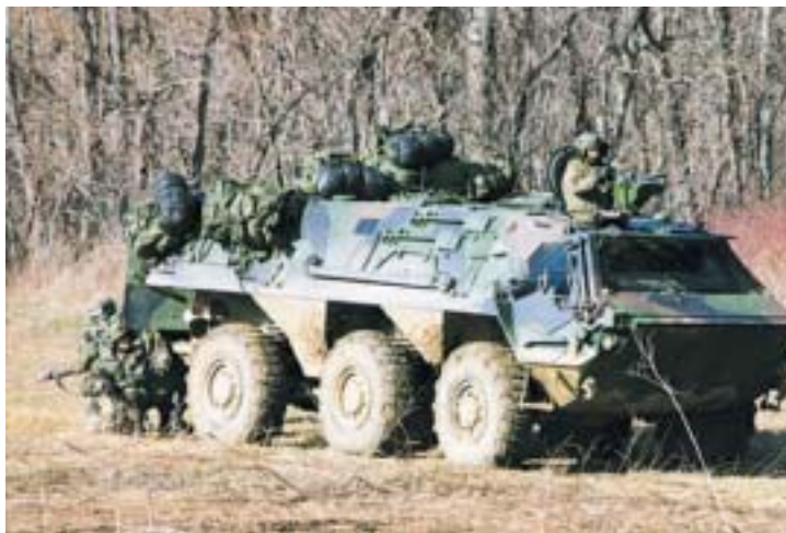
A Platform Performance demonstration of 35 potential Light Armored Vehicles for new combat infantry brigades was conducted at Fort Knox, Kentucky.

The Interim Force will fill the gap identified during Desert Shield until the Objective Force is fully fielded. Creation of this force will require the establishment of between six and eight Interim Brigade Combat Teams (IBCTs), equipped with more than 2,000 new Light Armored Vehicles and a Mobile Gun System.