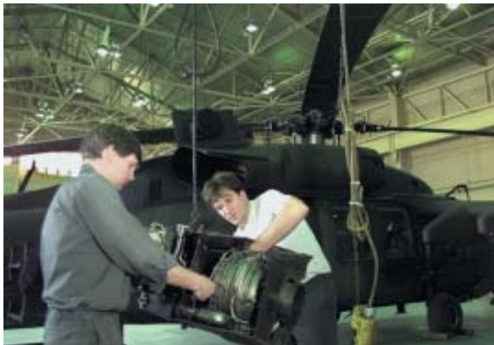
Depot Maintenance Activity Group has two primary responsibilities: maintenance and base operations.

Army Workload and Performance System. We completed implementation of the Army Workload and Performance System (AWPS) in FY 2001. AWPS is a human resources tool designed to analyze workload and to ensure the efficient allocation of resources across the AWCF. As a result of implementing AWPS, we are better able to estimate and schedule workflow, monitor per-