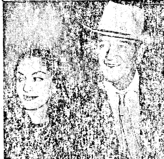
JOHN WAYNE AND 3D WIFE, PILAR PALETTE "We Think So Much Alike, in So Many Things"