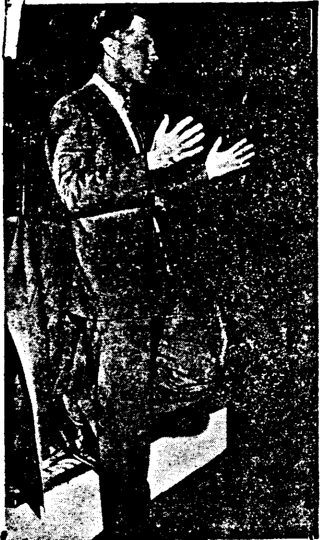
U.S. Atty. Gen. Robert F. Kennedy emphasizes his remarks with gestures at press conference in the Sheraton-Chicago Hotel.

"This is the work of the executive branch. We are trying to