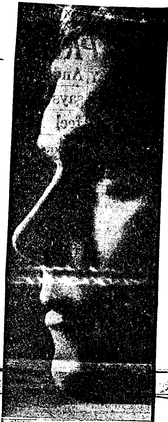
PROFILE OF A MARXIST (This was Burgess in his early years at Cambridge. This was the Communist in the making. This was the boy who was later to organize the waiters at Trinity College and help run a rent strike.)