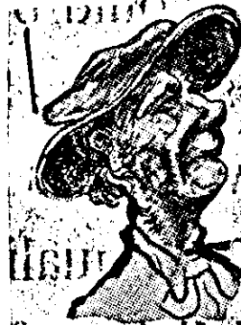
Another Burgess sketch . . . of a Cambridge bedmaker