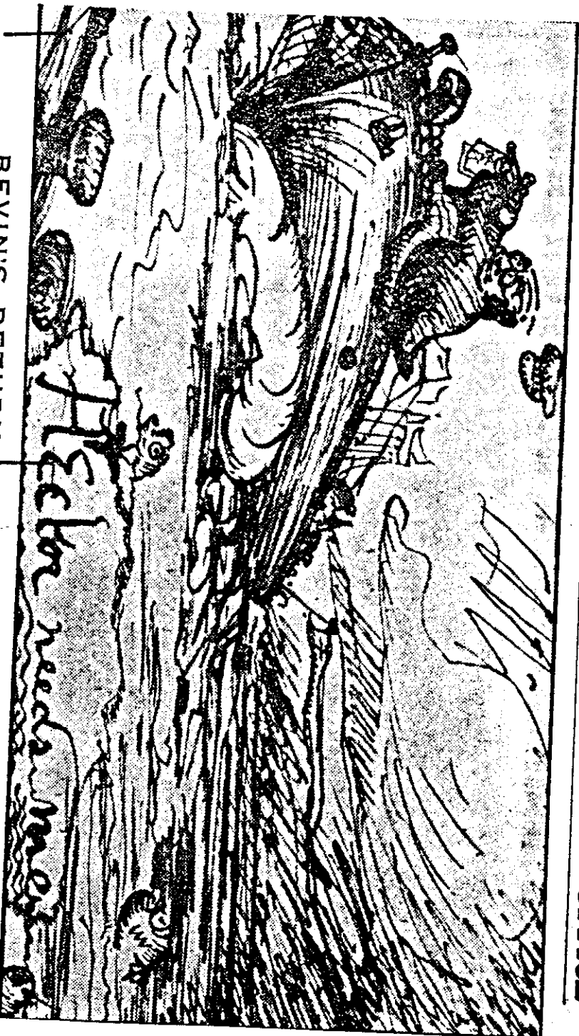
BEVIN'S RETURN . . . AS BURGESS SAW IT

AT LAST, AT 36, AFTER THE BBC AND 'SABOTAGE SCHOOL' . . . A TOP JOB AT THE FOREIGN OFFICE