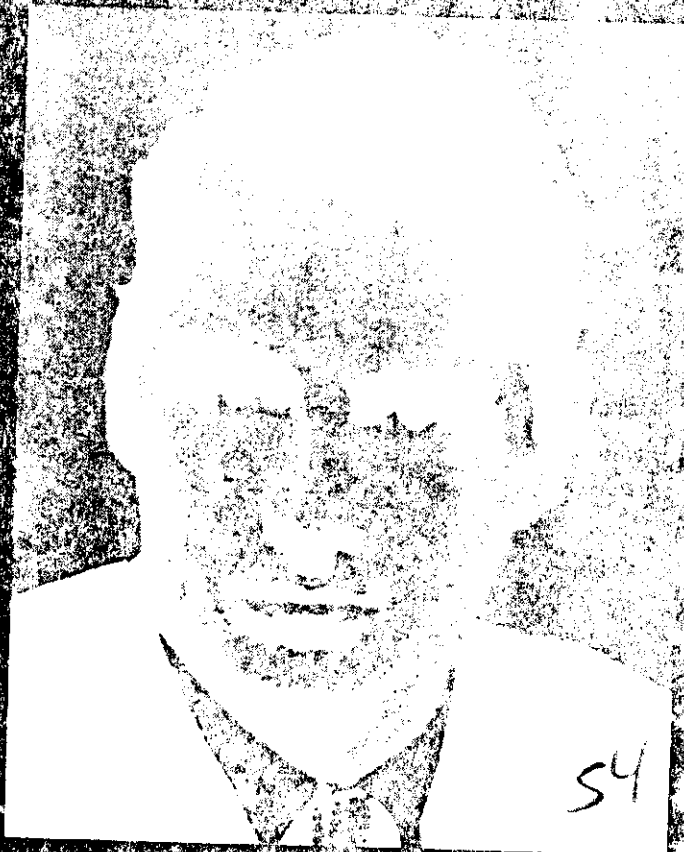
GUY BURGESS his passport photograph

And in 1942 he was accepted by the Foreign Office on a temporary basis. He joined the News Department, then went out on the Permanent Staff in January, 1943.