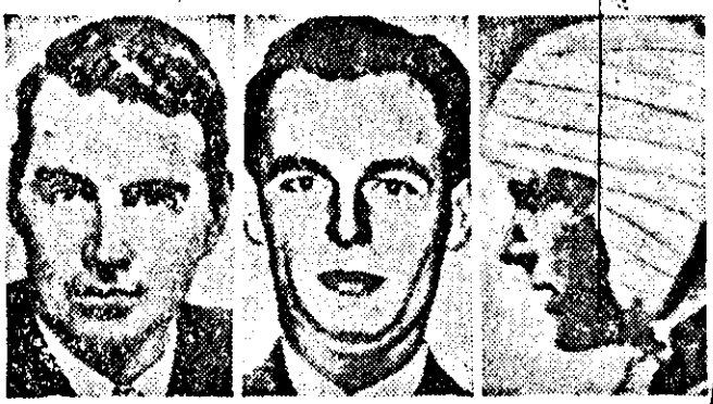
Guy Burgess Donald MacLean Harold Philby . . . "no evidence" that Philby tipped off others

Privy councillors are a select group of statesmen and na-