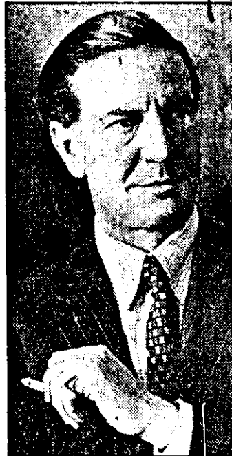
HAROLD PHILBY TALKS Let him make these charges outside the House.