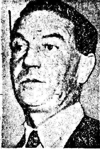
HAROLD PHILBY Calls Accusations "Gossip"

Channel and disappeared. But Mr. Macmillan made no accusation against Philby. He said: