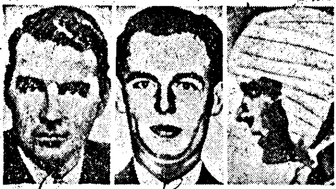
Guy Burgess Donald MacLean Harold Philby . . . "no evidence" that Philby tipped off others

"We should examine . . . the security measures now applied to the public service and also consider whether any further precautions can properly be taken to reduce the risk of such a breach . . . I therefore propose that we should convene a small informal conference of privy councilors from both sides of the House."