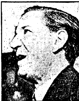
No, I am not trying to get my job back in the Foreign Office. I'm writing a book.