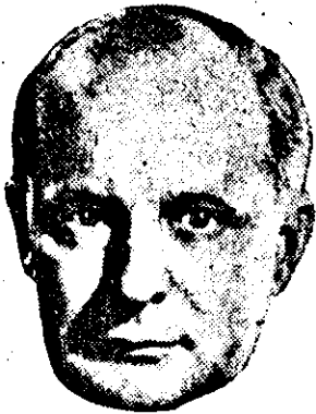
LORD ASTOR He attacked.

departments should have higher standards than private persons whether in the office or not. Was this conduct known or was it not?" he demanded.