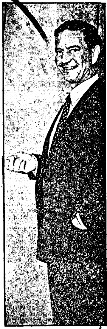
MR. H. A. R. PHILBY, former First Secretary at the British Embassy in Washington, talking to reporters at his parents' home in Kensington yesterday.

His even good humour in answering or blocking questions gave way to a touch of anger as he said: "On Oct. 25, Col. Lipton, from a safe place, sneaks into a supplementary question the charge that I was guilty of a crime for which the maximum penalty is 14 years, or something of that order."