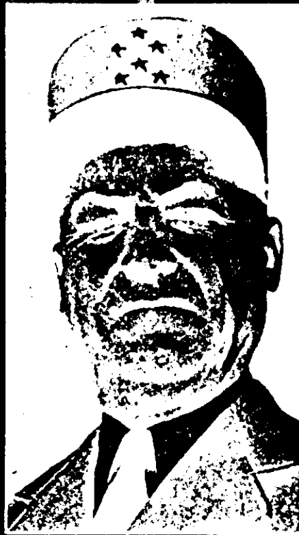
Jun: Morocco for Frenchmen

Wednesday in Paris. After three days of consultation with the Cabinet (and Juin), Resident-General de Latour returned to Morocco not with new instructions but with authority to make his own decisions. De Latour so far has shown no desire to buck the die-hard generals, in fact has urged Faure to go slow on reforms.