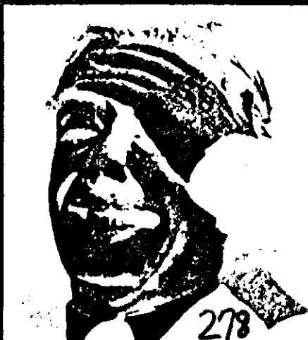
Eden: Why the uproar?

"An insult to any reasonable man's intelligence," said Lord Beaverbrook's Lon-