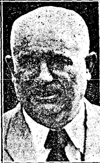
Red Boss Khrushchev Said he was in the dark

MacArthur's views on this, which mention specifically Burgess and Maclean, reached Moscow 48 hours before a decision was made to bring the two British defectors out of their long concealment.