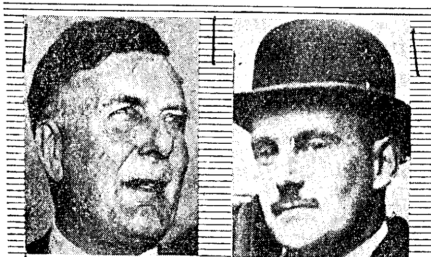
SIR PERCY SILLITOE