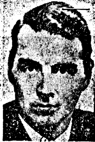
GUY BURGESS. He Had the Motive.

But Burgess, it is felt, was a type of man wholly incapable of organizing and carrying through a disappearing act of the sort