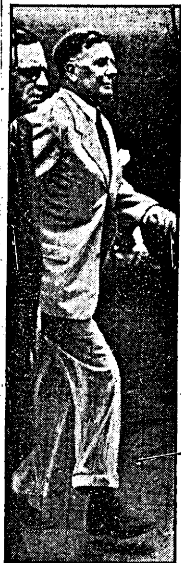
Sir Percy Sillitoe (light suit) arriving at London Airport to-day.

from the emergency exit in the tail, while other passengers were walking down the usual gangway on the other side.