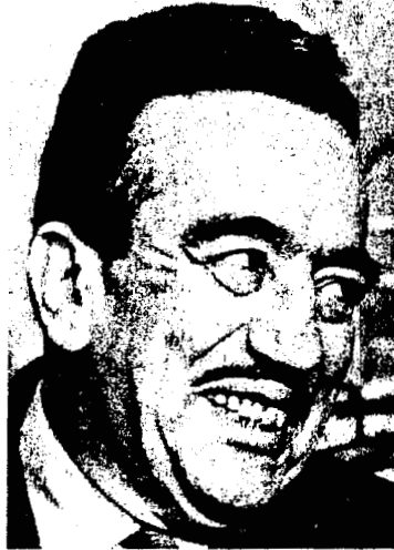
Khalid Bakdash Secretary General Syrian Communist Party

In early November 1969 it was reported that the CPJ had also decided to establish its own commando organization and that it had assurances that the USSR would supply it with weapons and money. This was particularly significant as the CPJ had traditionally been more opposed to fedayeen activities than any of the other Arab communist parties. The CPJ had apparently been split for some months over this issue* and finally decided that its policy of non-involvement had hurt it and that it must participate in order to survive. Its goal, however, would be to "remove Israeli aggression," not to destroy Israel. Training of CPJ commandos was said to be underway in November.