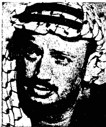
Yasir Arafat Chairman PLO Central Committee and Fatah

In its search for funds, Fatah also turned to the USSR. On 2 July 1968, two days before Nasir's departure on a visit to Moscow, Fatah leader Arafat arrived in Cairo. Arafat had been officially named Fatah spokesman in the spring of 1968, though he had been one of the organization's leaders from its inception and had previously been regional head of Asifa. Arafat apparently now asked that Nasir intercede with the Soviets to change their position towards the Palestinians, supposedly