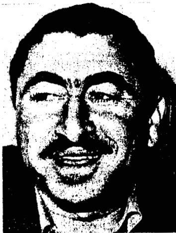
Naif Hawatmah Leader PDFLP

In purely ideological terms, the PDFLP is one of the most radical of the Palestinian fedayeen groups. In July 1969, its leader Naif Hawatmah described it as a