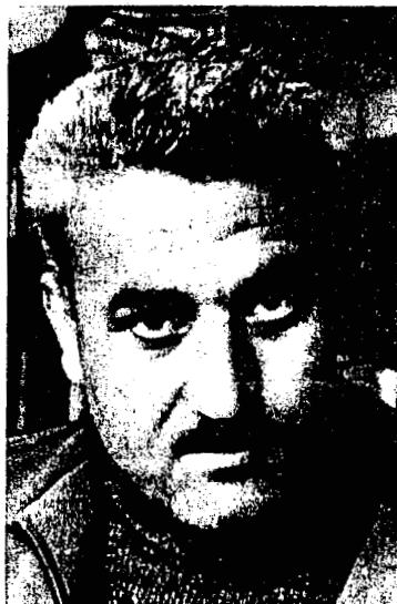
George Habbash Leader PFLP

In 1955 the leader of the international ANM, George Habbash, a Palestinian Christian who had been working in Jordan, was forced to leave that country because of his involvement in subversive activities. He spent a year in Syria, then returned to Jordan with Syrian financial assistance to organize his group. Expelled from Jordan again in 1959, he went to Damascus where, during the period of the