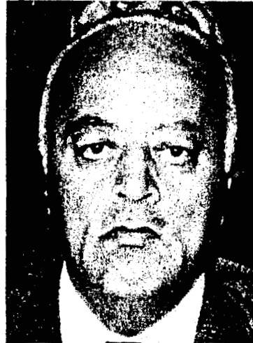
Ahmad Shuqayri First PLO Leader

However, as tension mounted between Israel and the Arab states in late 1966 and early 1967, the prestige of Fatah, which was mounting operations into Israel, increased while that of the UAR-backed PLO declined. Shuqayri, undoubtedly operating with Nasir's approval, decided the time had come for the PLO to act. On 22 November 1966