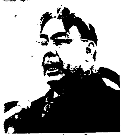
Brezhnev: Gathering Power