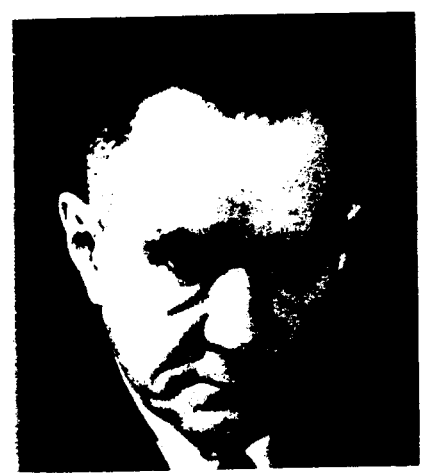
Kosygin: Minority Premier