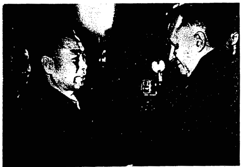
Chou being greeted by Kosygin at a Moscow airport on arrival 5 November.