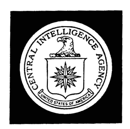
DIRECTORATE OF INTELLIGENCE