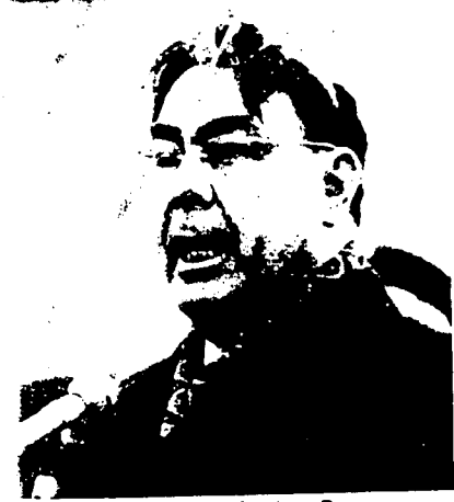
Brezhnev: Gathering Power