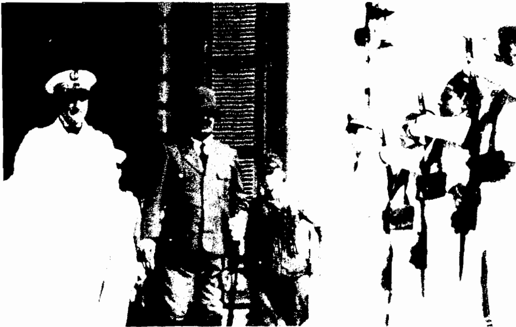
(U) French governor-general Admiral Jean Decoux and unidentified Japanese general officer receive salute from French sailors.

Foreign Legionnaires, backed by artillery and planes, struck back mercilessly. The American consul in Saigon reported that the French were "promiscuously machine-gunning" towns and burning entire villages. 2 Thousands of Vietnamese were imprisoned or executed. The Japanese, reporting from Saigon to Tokyo on the state of affairs in Indochina at the end of November, referred to this as "a little unrest" caused by sweeps against the communists in Cochin China and blamed it on Vietnamese who were "puppets" of either the Chinese or Gaullists. 3