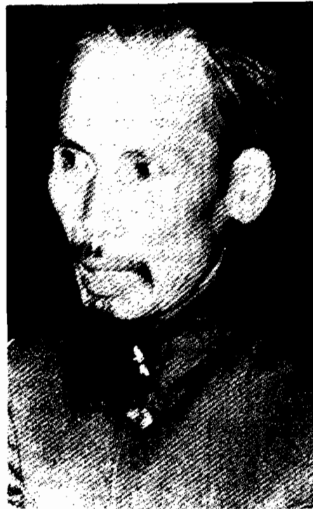
Ho Chi Minh

(U) In April 1944, Hanoi reported the existence of two groups: the Viet Minh and the Dong Minh Hoi. The Japanese Army also had information about a communist group that had an office on Tientsin Road in Hanoi. This may have been the Indochinese Communist Party which was the core of the Viet Minh political arm. The report goes on to describe how these communists used employees of the French Post and Telegraph Department in an unknown capacity. 21 They issued a regular periodical (possibly the Viet Lap or Independent Viet Nam ) and held regular lectures. The report went on to describe several instances of propaganda leaflets being distributed in rural areas. The Japanese were not certain of the names of the leaders of the communist activity, except for Nguyen Ai Quoc (Ho Chi Minh). 22 The Japanese also admitted that the movement had spread (though they didn't say how far) and that it had a definite anti-Japanese flavor to it, as well as the expected anti-French.