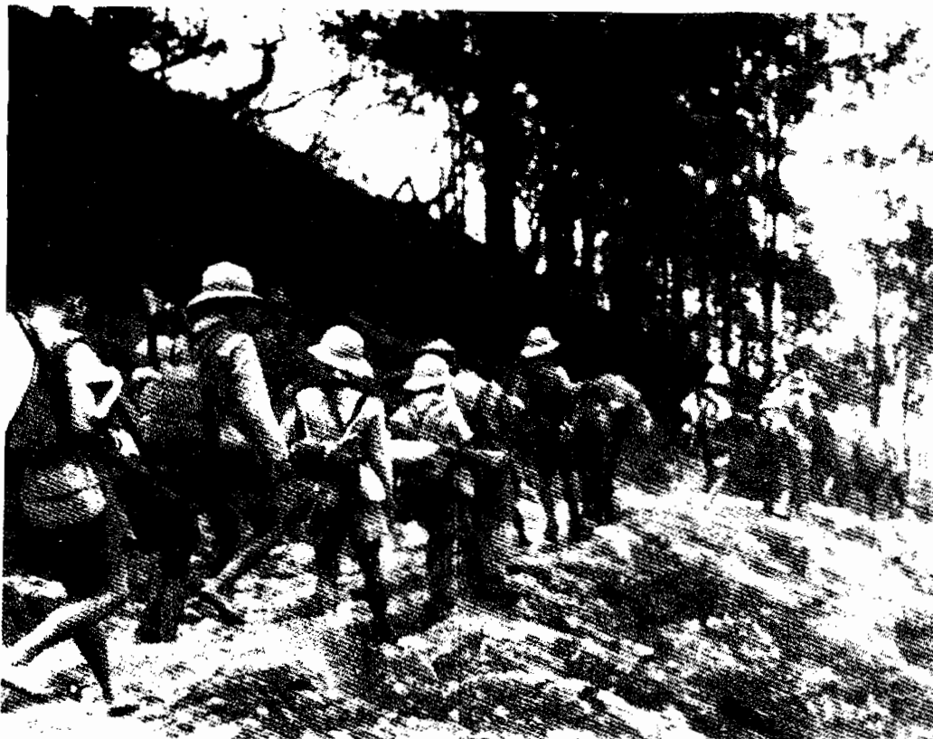
(U) French colonial troops retreating into southern China, March 1945