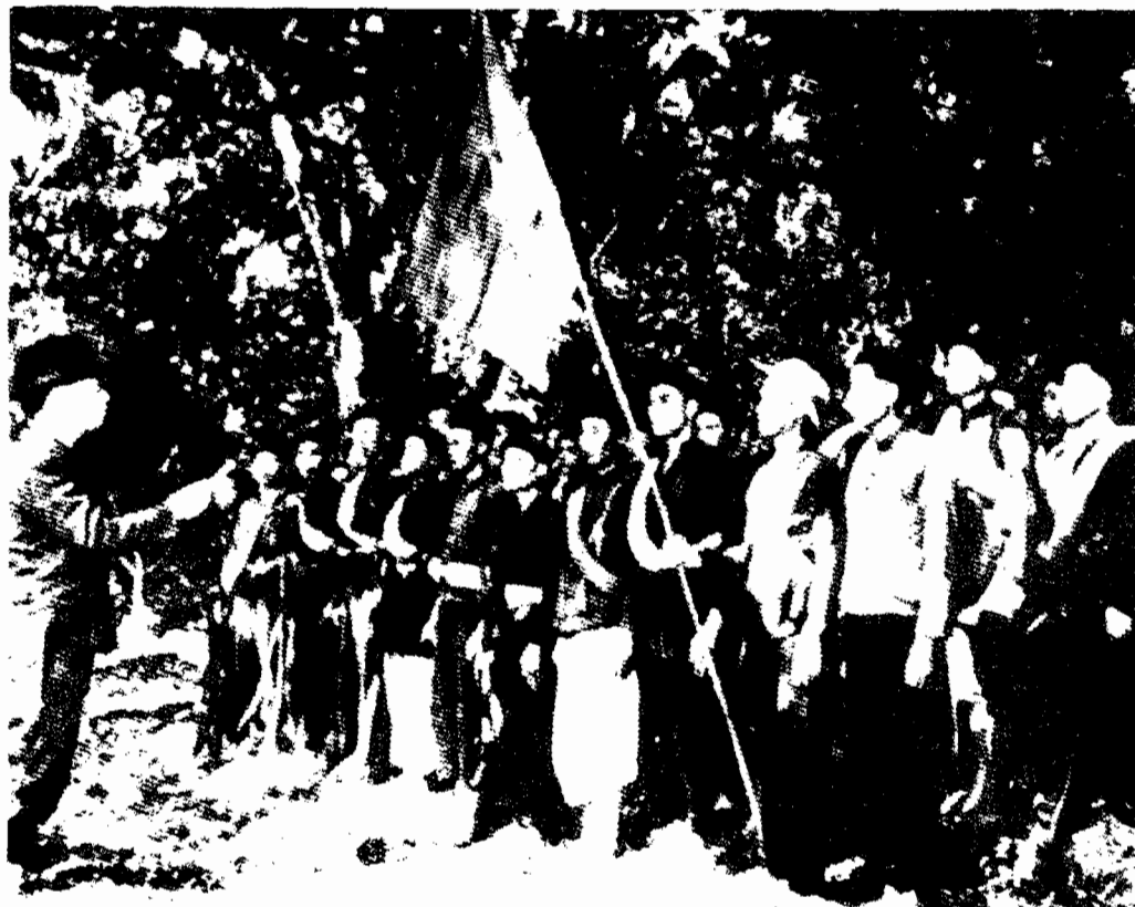
(U) Vo Nguyen Giap addressing Armed Propaganda Unit, 1945