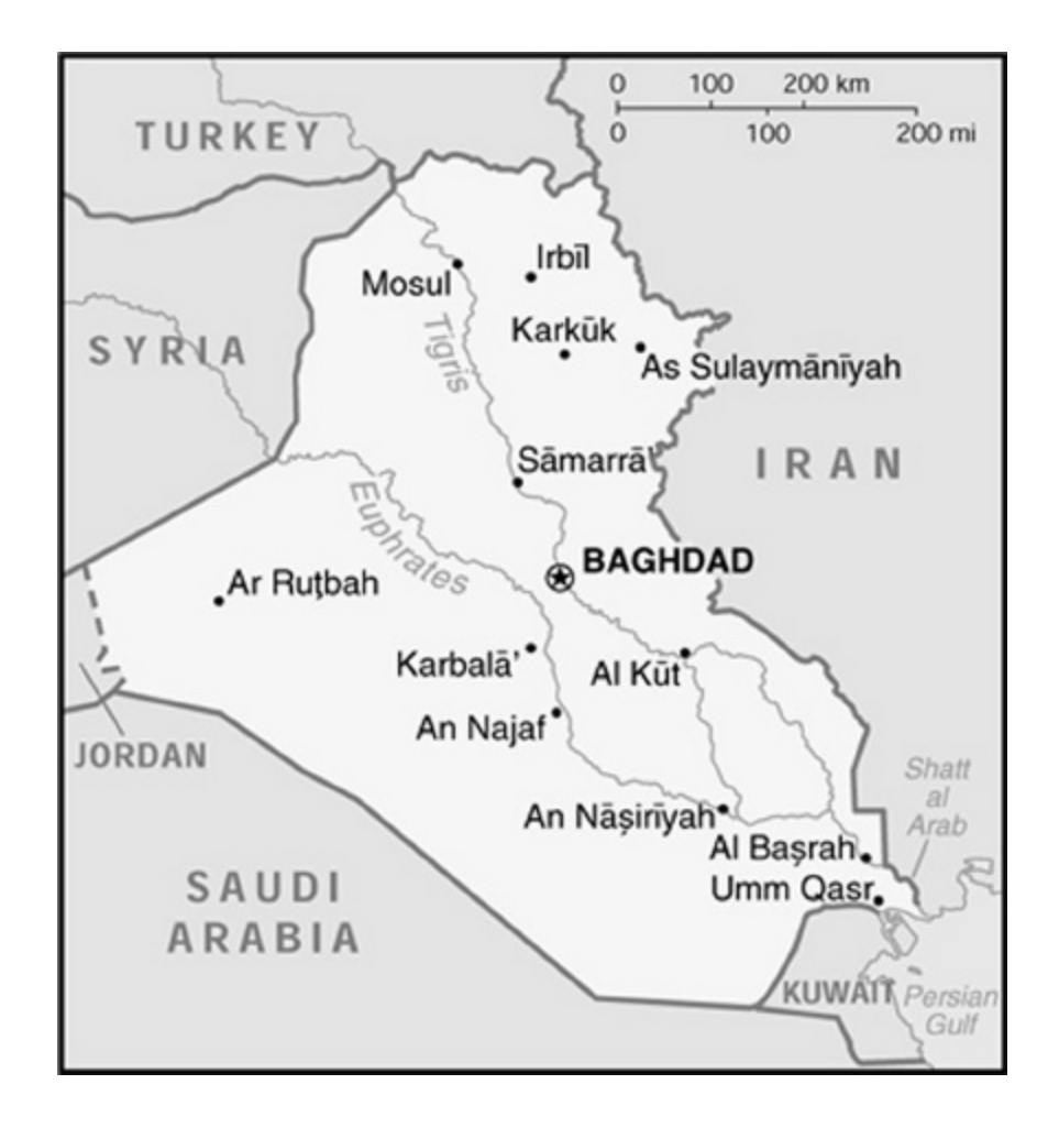
Figure 1. Map of Iraq

for medical purposes, and, in humanitarian circumstances, foodstuff' were excluded from the sanctions.<sup>12</sup> At the same time all Iraqi assets abroad were frozen.