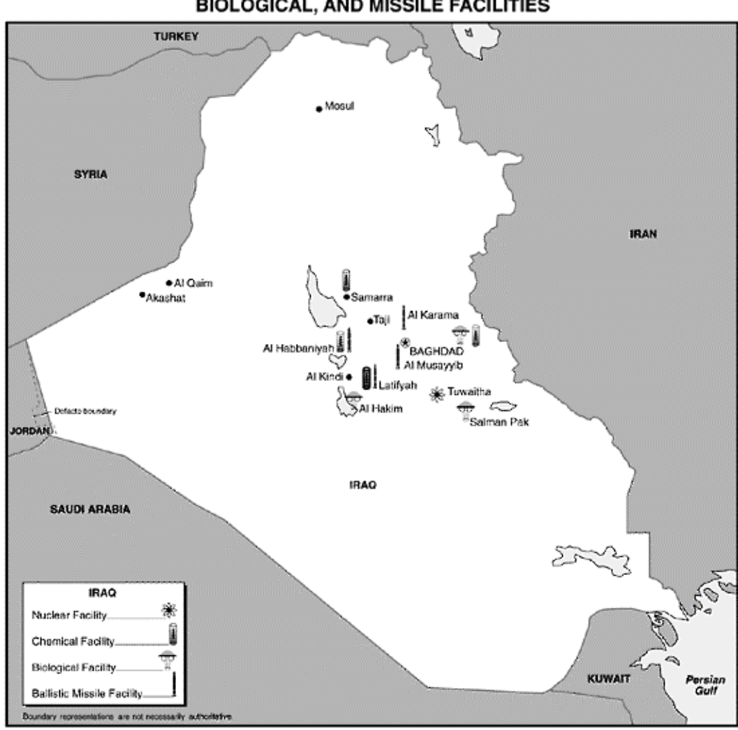
SELECTED NUCLEAR, CHEMICAL, BIOLOGICAL, AND MISSILE FACILITIES

Despite severe war damage and four years of UN inspections, Iraq retains some infrastructure to resurrect many of its NBC weapons and missile programs.