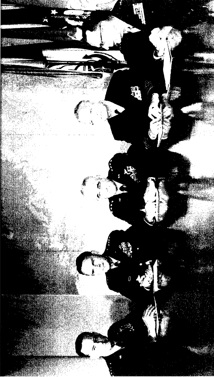
General Nathan F. Twining, USAF, Chairman of the Joint Chiefs of Staff, with his JCS colleagues, September 1957. Left to right: General Thomas D. White, Chief of Staff, USAF; General Maxwell D. Taylor, Chief of Staff, USA; General Twining; Admiral Arleigh A. Burke, Chief of Naval Operations; and General Randolph McC. Pate, Commandant, USMC.